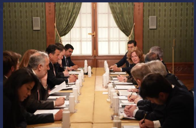
(Latin American Health Roundtable, organized at the margins of the OECD Health Ministerial, January 2024)

At the margins of the Health Ministerial, we organized a Latin-American Ministerial Roundtable, held under the topic of strengthening resilient health systems through the transformation of public health architecture. Gathering several ministers and OECD Ambassadors, the event explored opportunities for collaborative construction and co-creation of resilient health systems, aligning strategies with inclusivity, innovation, and equitable access.