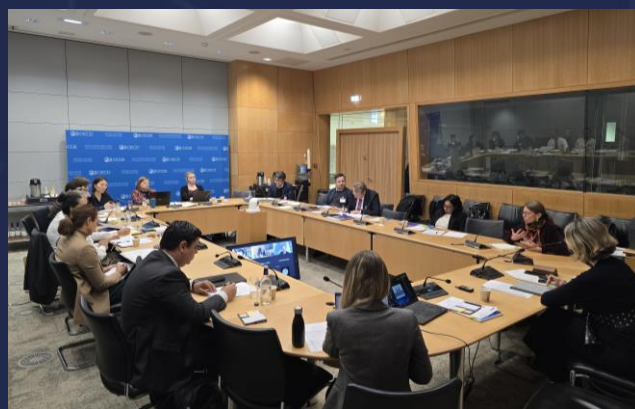
(Business at OECD Health Committee meeting, June 2024)