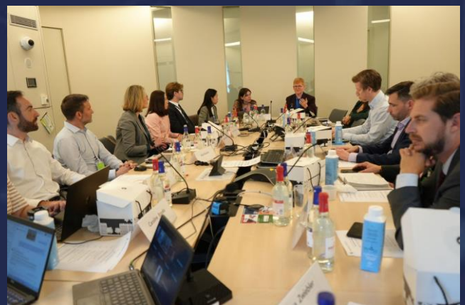
(Business at OECD Health Committee meeting, June 2024)