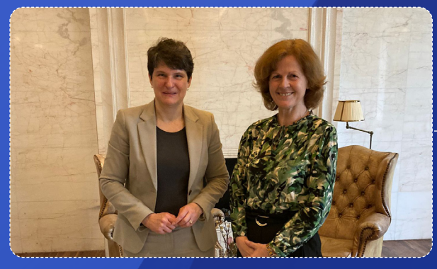
FEBRUARY 2024 BDI , Germany