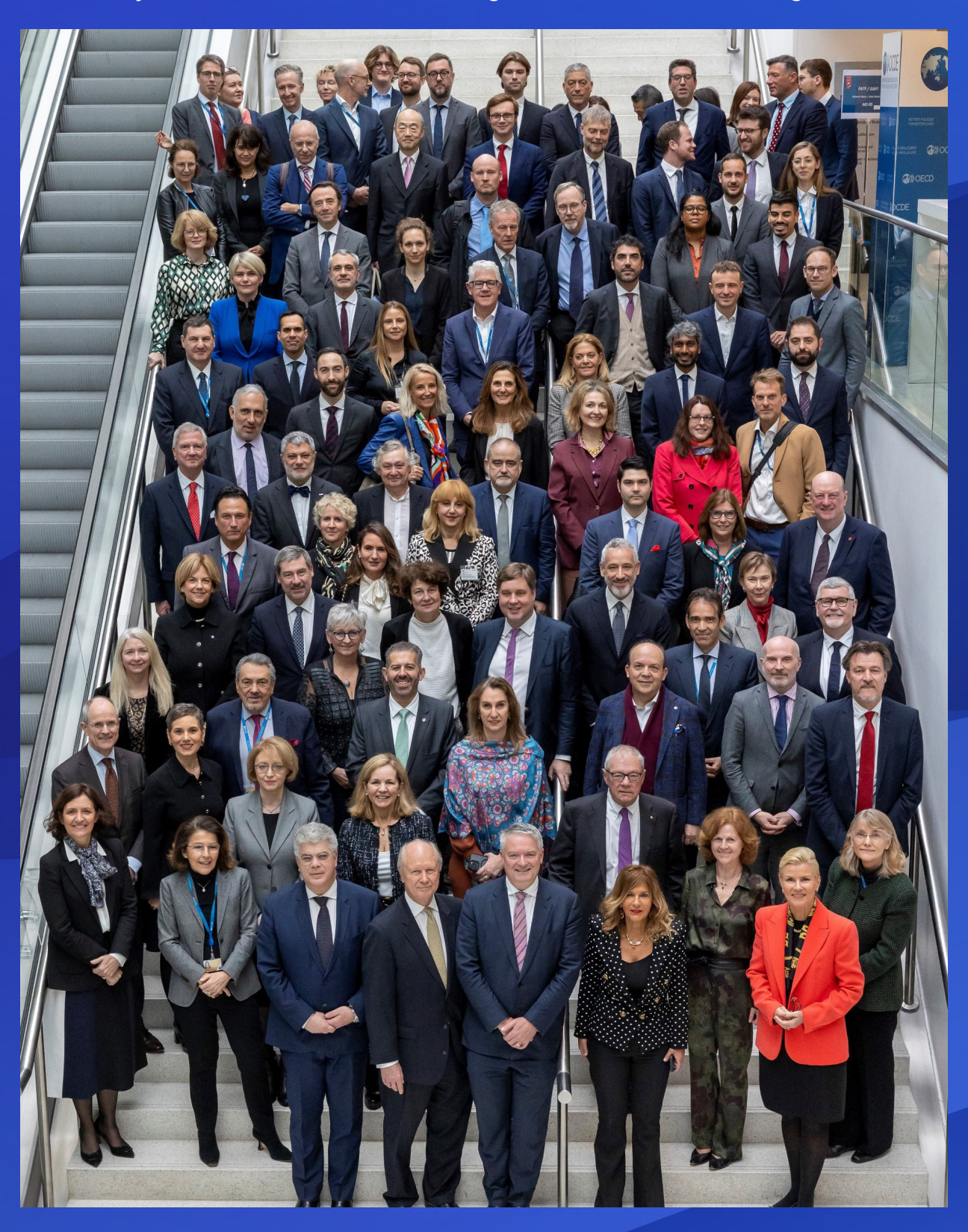
Business at OECD's 2024 Annual Consultation with the OECD's Leadership and Ambassadorsin February 2024 Family Photo.

Through Business at OECD , national business and employers' federations representing over 10 million companies provide perspectives to cutting-edge OECD policy debates that shape market-based economies and impact global governance. Our expertise is enriched by the contributions of a wide range of international sector organizations.