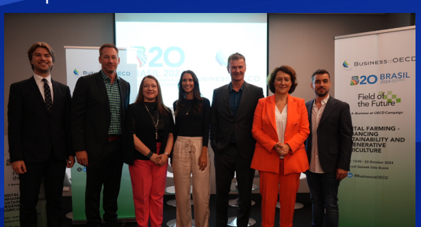
Panellists from our Field of the Future Side-Event to the B20 Brazil Summit in October 2024.

The campaign gained prominence during December's Health Forum, which addressed labor shortages, digitalization, mental health, and continuity of care. This platform strengthened dialogue with governments and stakeholders, culminating in a synthesis report to inform future policies.