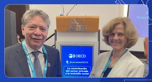
OCTOBER 2024 ANDI, Colombia