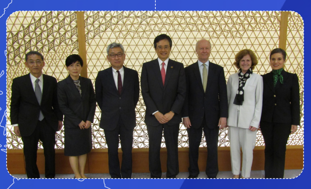
MARCH 2024 Keidanren, Japan