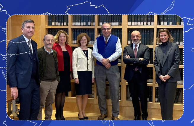
FEBRUARY 2024 Assonime, Italy